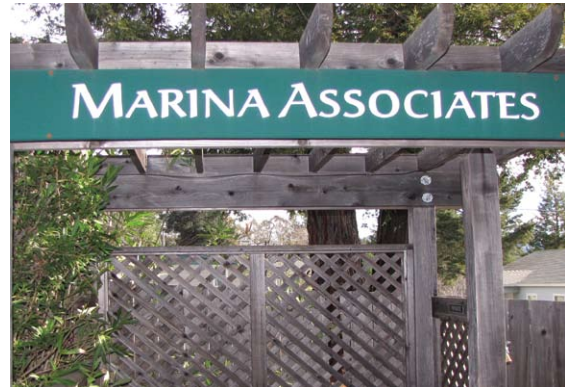
Our Santa Rosa Office

23% of U.S. waste materials is potential compost. Visit www.ciwmb.ca.gov for composting programs in your area.